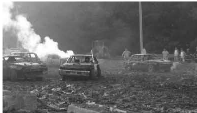
Scenes of destruction at past Fall Brawl Demolition Derby